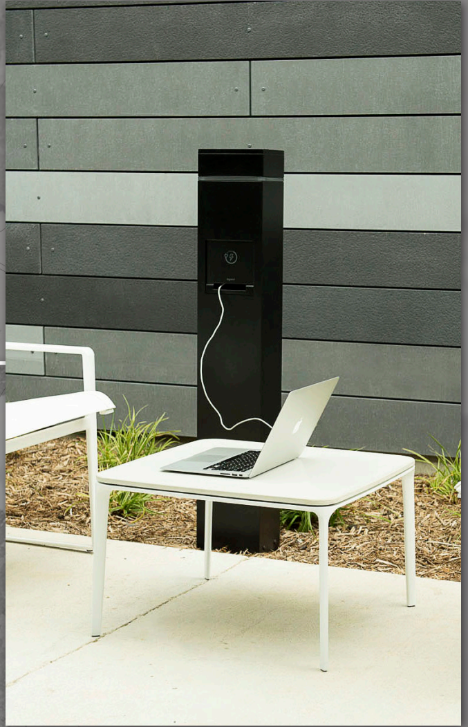
Power pedestal (4 total)