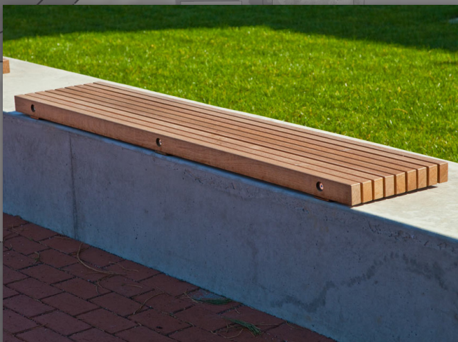
Wall mounted benchtop