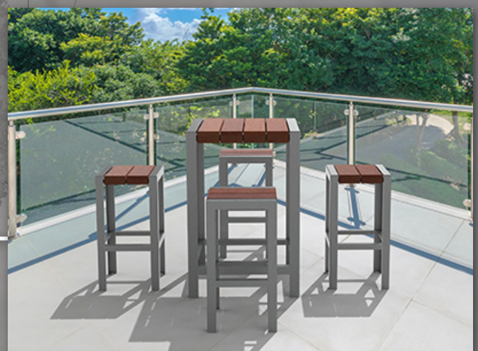
Square bar height table and stools