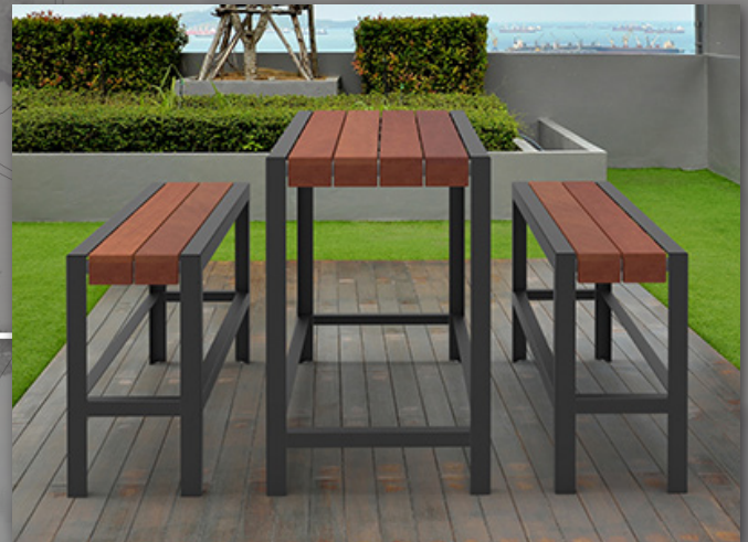
Long Bar height table with benches