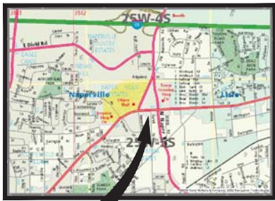
SITE LOCATION MAP NOT TO SCALE