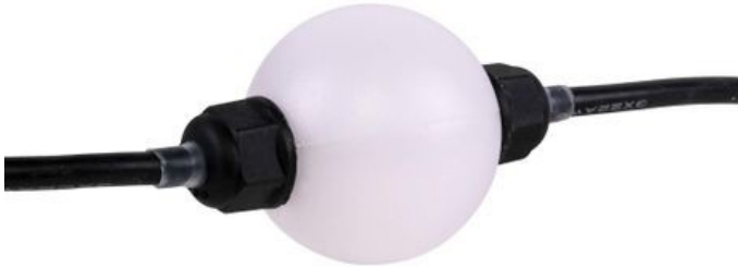
SAMPLE INDIVIDUAL LED LIGHT