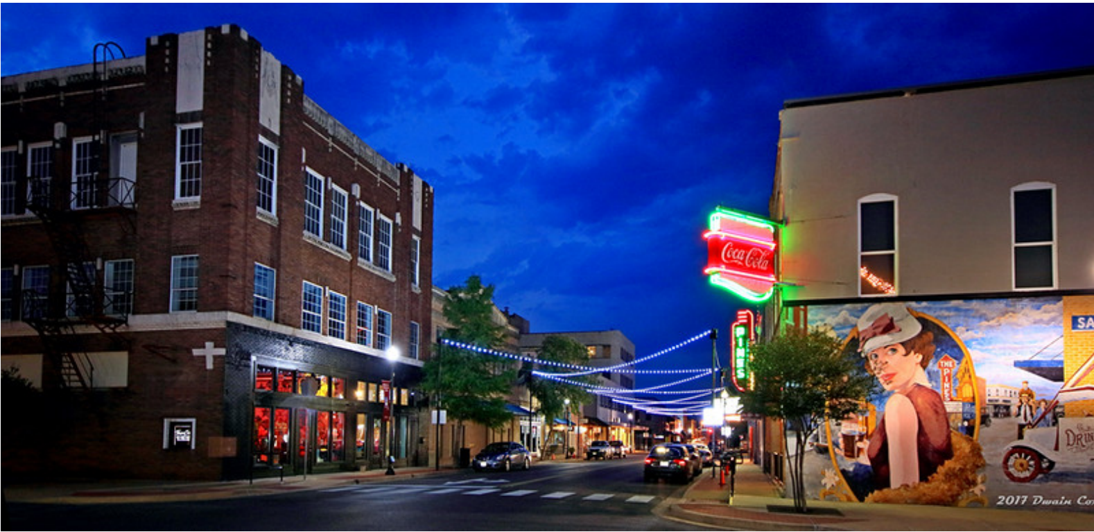
SAMPLE INSTALLATION - LUFKIN, TX

NOTE: Lights in this sample are poll mounted. Water Street proposal will be wall mounted.